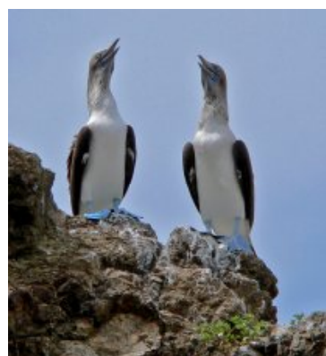
Two Blue Footed Boobys. Lorraine Meharry