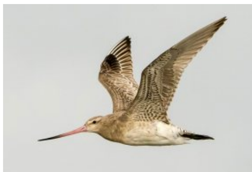
Godwitt in Flight. Both Nature