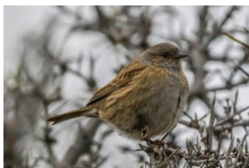
Female Tomtit &