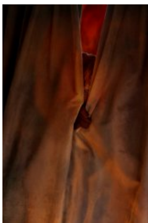
Behind & Kereru Trapped