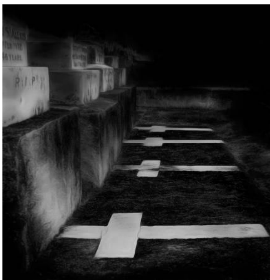
Catholic Sisters' Graves. Rhonda Bunyan. Open