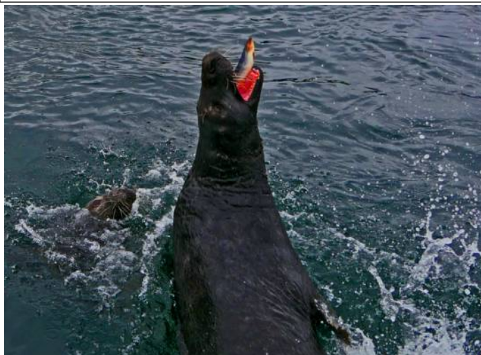
Seals in North Sea. Nature.