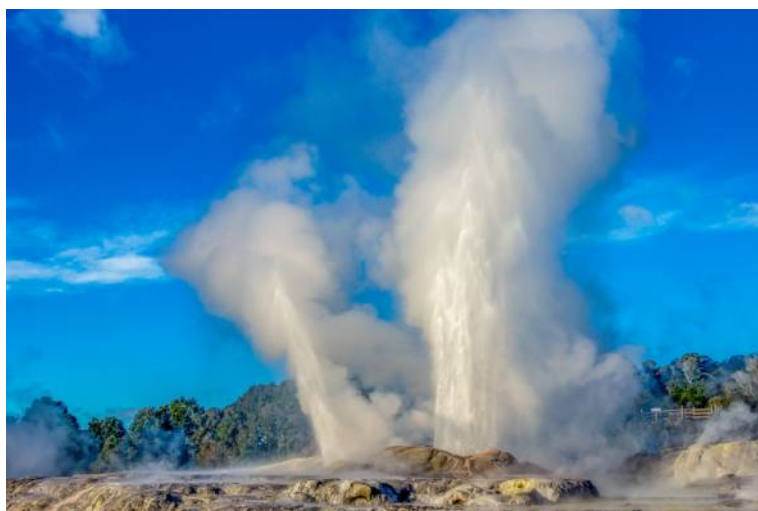
Pohutu Geyser.