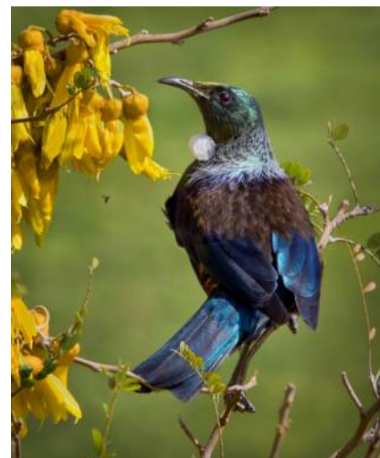
Tui & Bee in Kowhai. Nature